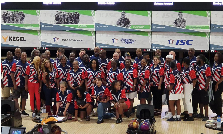
The Tampa Bay Strikers!

Each squad will have its own Mystery Score. Cost is just $15 prepaid for all 3 events and it will pay out THOUSANDS OF $$$! After each squad, a score will be pulled from the Mystery Score drum. If you bowled that game in your 2nd game – the pot is yours! We will keep pulling a game until it is hit each squad! Must be entered prior to bowling any of the main events.