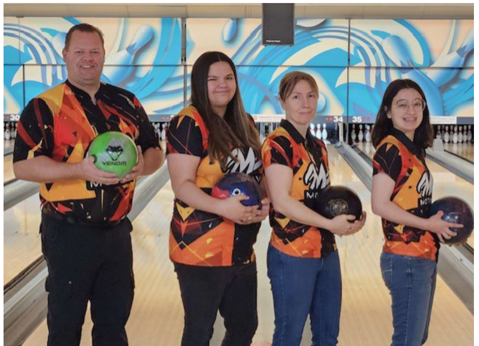
The Defending Champs - The Ballbarians #1

Although these 2 Sweepers tend to be the smallest of the 3-game handicap Sweepers, we want to continue them as many bowlers look forward to them. But we also feel there should be a larger “pay day” for their efforts. So effective with this year’s tournament, both of these Sweepers will run for the entire tournament. So instead of the smaller daily prize funds, you can bet that the purse will increase greatly and create more prizes!