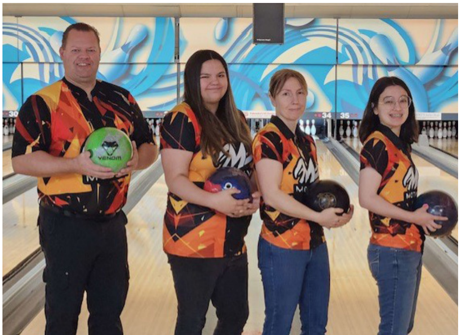
The Defending Champs - The Ballbarians #1

Although these 2 Sweepers tend to be the smallest of the 3-game handicap Sweepers, we want to continue them as many bowlers look forward to them. But we also feel there should be a larger “pay day” for their efforts. So effective with this year’s tournament, both of these Sweepers will run for the entire tournament. So instead of the smaller daily prize funds, you can bet that the purse will increase greatly and create more prizes!