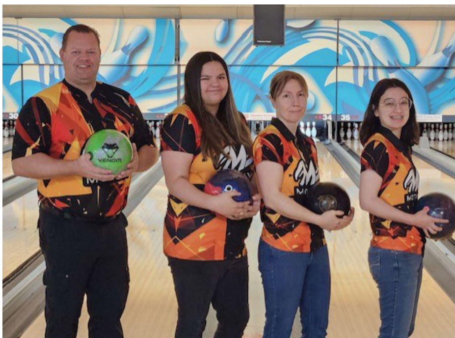
The Defending Champs - The Ballbarians #1

Although these 2 Sweepers tend to be the smallest of the 3-game handicap Sweepers, we want to continue them as many bowlers look forward to them. But we also feel there should be a larger “pay day” for their efforts. So effective with this year’s tournament, both of these Sweepers will run for the entire tournament. So instead of the smaller daily prize funds, you can bet that the purse will increase greatly and create more prizes!