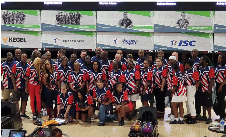
The Tampa Bay Strikers!

Each squad will have its own Mystery Score. Cost is just $15 prepaid for all 3 events and it will pay out THOUSANDS OF $$$! After each squad, a score will be pulled from the Mystery Score drum. If you bowled that game in your 2nd game – the pot is yours! We will keep pulling a game until it is hit each squad! Must be entered prior to bowling any of the main events.